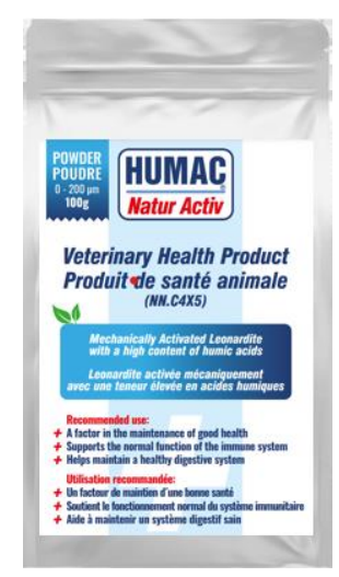
Powder 0 – 200 μm 100 & 500 g packaging Includes measuring spoon

Humac Natur Activ's efficacy has been demonstrated in over 25 peer-reviewed scientific studies as well as customers continue to see its effects in the EU over the past 10 years.